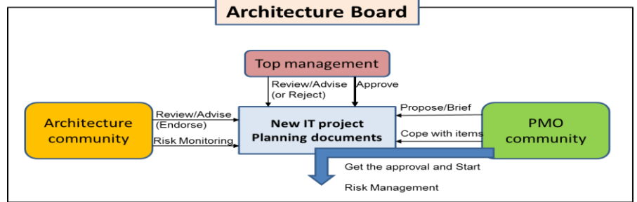
Figure 3. Roles and Organizations diagram in Architecture Board

Actually, one of the authors works in this global pharmaceutical company and conducted all phases of structuring and implementing in this EA framework and was the facilitator and managed the coordination of the global Architecture Board. In this global pharmaceutical company, I have the above responsibilities in the Assessment/Architecture Review phase on the global Architecture Board as shown in Table 2, which we are focusing on now, and perform the above tasks. On the other hand, project managers in PMO community propose and brief each new IT project planning documents while I and architecture community members perform reviews and advise their project planning documents and top managements also review and advise (or reject). If the architecture community endorses them, top managements will approve them, and project managers can start these new IT projects. Figure 3 shows the roles and organizations diagram in Architecture Board.