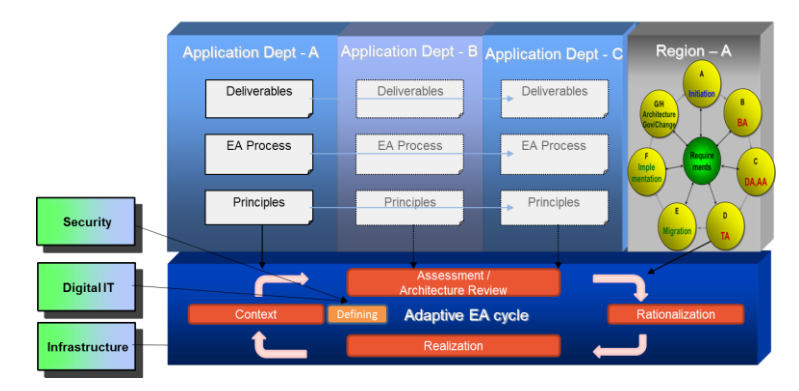
Figure 2. AIDAF proposed model (ex: TOGAF and Adaptive EA framework, etc.)

In a particular Architecture Board, the example of the EA framework structure in a certain global pharmaceutical company examined in this paper is explained. This global pharmaceutical company is the largest Japan-headquartered global company in the industry in Asia based on a sales basis. In a global EA rollout, they are handling Cloud/Mobile IT/Big Data strategic projects and systems that took priority in Europe and US Group companies well by structuring and implementing EA with the above Adaptive Integrated Digital Architecture Framework - AIDAF to be consistent with global IT strategy focusing on Cloud/Mobile IT/Big Data/Digital IT. Table 2: Responsibilities and Tasks of the Architecture Board